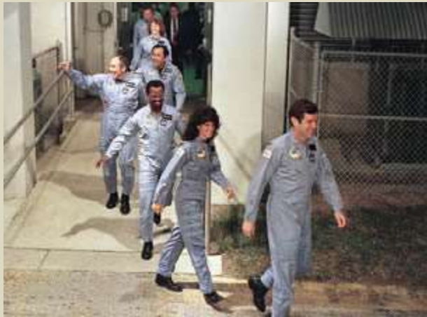
The seven-astronaut crew for Challenger's fatal mission smile as they leave for the launch pad.