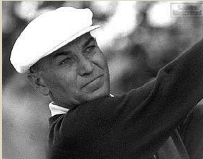
William Ben Hogan August 13, 1912 – July 25, 1997

Ben Hogan is regarded as one of the greatest players in the history of golf. Nicknamed “The Hawk,” Hogan possessed fierce determination and an iron will. His work ethic was unmatched and he prepared for tournaments like no other. When asked how he could consistently beat the greatest players in the world Hogan replied. “If you can’t out play them, outwork them.”