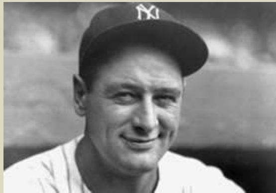
Lou Gehrig The Iron Horse June 9, 1903 - June 2, 1941

One of the greatest examples of expressing gratitude in times of a personal crisis was demonstrated by Lou Gehrig. Gehrig is regarded as one of the most talented baseball players of all time. Sportswriter Jim Murray once described him as "Gibraltar in cleats." He played 2,130 consecutive games a feat that earned him the name "the Iron Horse." It was a record that would stand until just a few years ago.