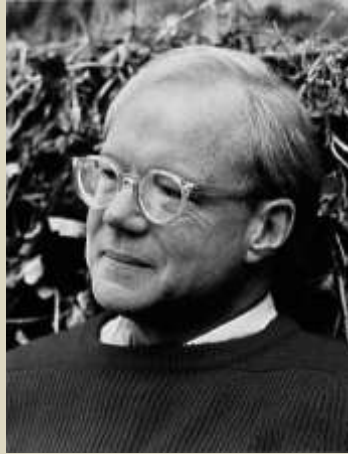
M. Scott Peck, M.D. May 22, 1936 - September 25, 2005

Accept the fact that things will not always go your way regardless of how just you are