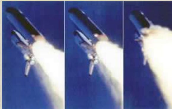
This photograph was taken just seconds before the spacecraft exploded.