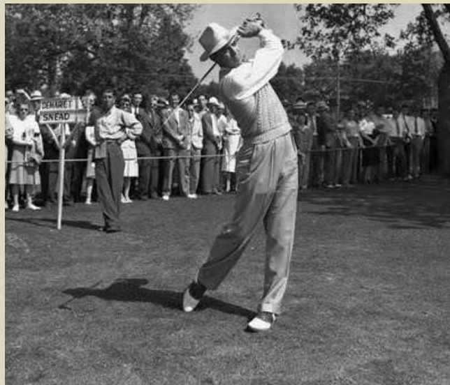
Sam Snead May 27, 1912-May 23, 2002

I would like to conclude with a story. It was told by the late golfing legend Sam Snead about another legend, Bobby Jones.