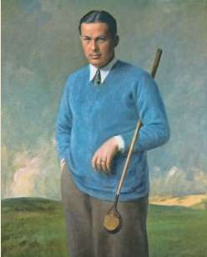
Robert Tyre "Bobby" Jones March 17, 1902 - December 18, 1971

Early in his amateur career, Jones was in the final playoff of the 1925 U.S. Open at Worcester Country Club. During the match, his ball ended up in the rough just off the fairway, and as he was setting up to play his shot, his iron caused a slight movement of the ball. He immediately got angry with himself, turned to an official and called a penalty on himself.